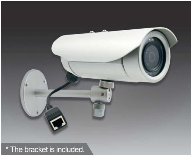
* The bracket is included.