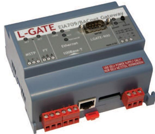
EC650 - BACnet Gateway