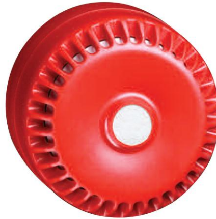
FX002 low profile surface sounder, red