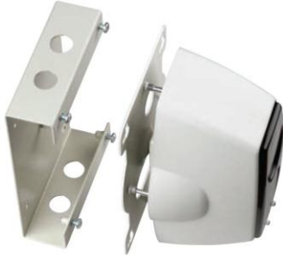
optional mounting bracket with cable clamp facilities