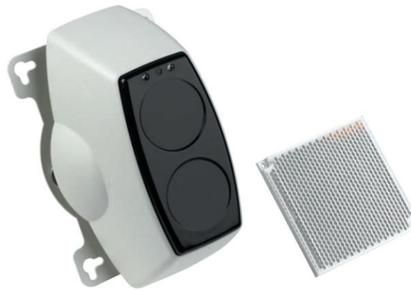
MAB50R and MAB100R reflective beam detectors